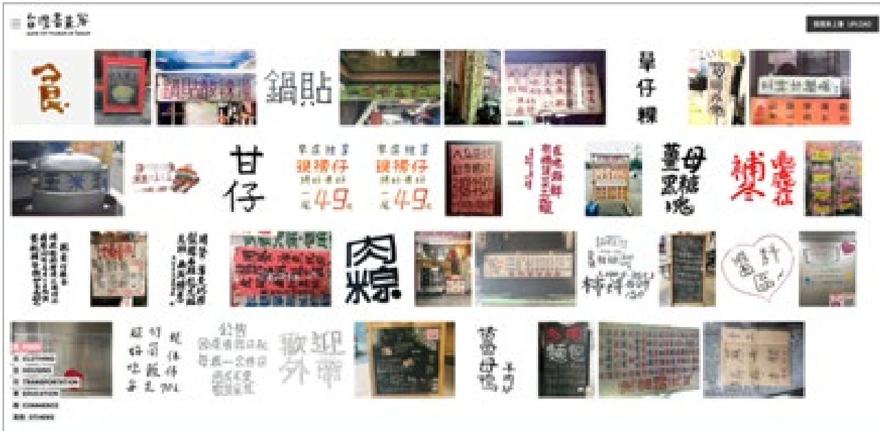
Fig. 4. Self-designed and established open-platform website.