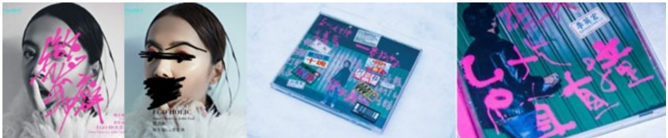
Fig. 2. Godkidlla's music album design.

apply various symbols to understand their situation and establish a visible identity. Hence, subculture can be a manifestation of self-expression, individual autonomy, and cultural diversity. It constitutes a unique social style closely related to an individual's freedom from the influence of secular values (Muggleton, 2000). The music album design by Taiwanese designer, Godkidlla shows the street spray-painted characters who were looking for jobs as inspiration for the design of Jolin Tsai's music album in 2016 and Lee Ying Hong's music albums in 2016. The visual inspiration for the covers is taken from the common sentence "Do you need a worker?" on the iron sheet beside the road (Fig. 2).