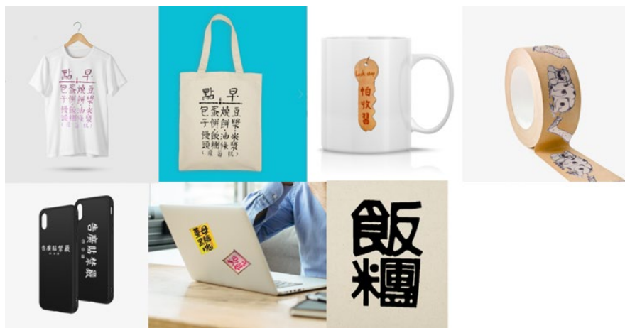
Fig. 5. Self-designed culturally creative goods for experts and scholars to test their preferences and feasibility.

The handwriting design as the style of culturally creative products was tested in the second round of the questionnaire survey and expert opinion was sought as shown in Fig. 5. The questionnaire was presented in Table 2.