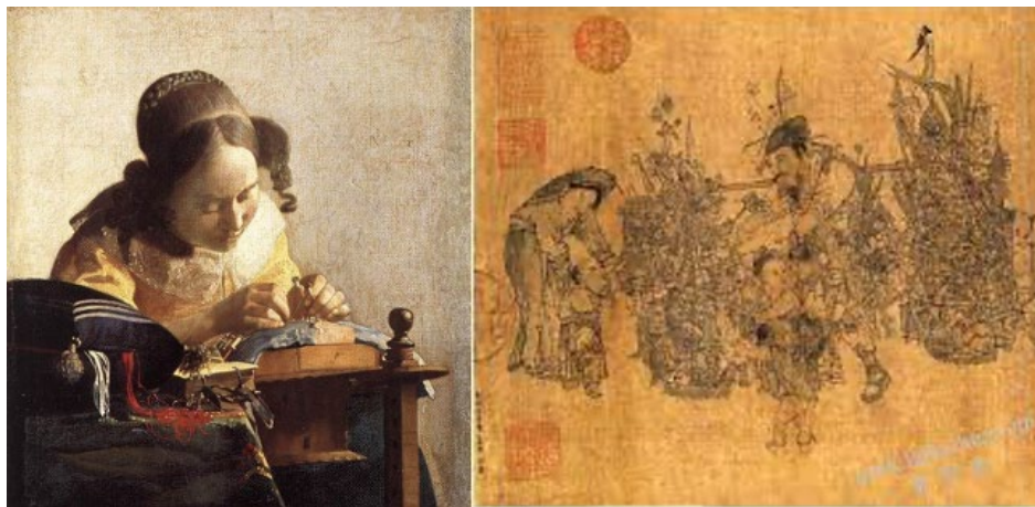
Fig. 3. Genre paintings.

The golden cross of the historical painting and the genre painting appeared in the late 18th century when the influence of commoner's art crafts overturned the orthodox status. In the 19th century, the dominance of the genre painting took over the authoritarian historical painting, which echoed the political change: power was no longer in the hands of the elite and the plebeian's arts was on the rise (Fig. 3).