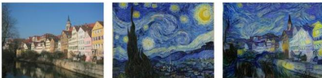
Fig. 1. Paintings created by DeepArt using the original picture of Vincent van Gogh's Starry Night . (EPFL, 2024).

DeepArt is an AI platform that creates artwork using neural transfer. In its platform, the style of one image is transferred to the content of another image. Figure 1 shows an artwork that was created by DeepArt (EPFL, 2024; Gatys et al. 2015).