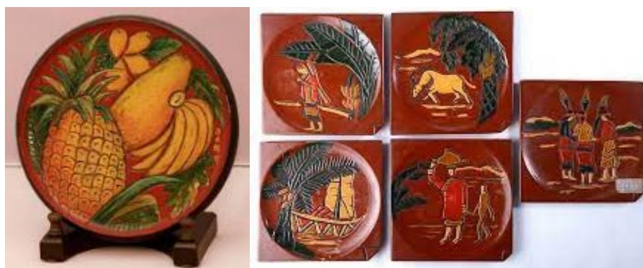
Fig. 1.