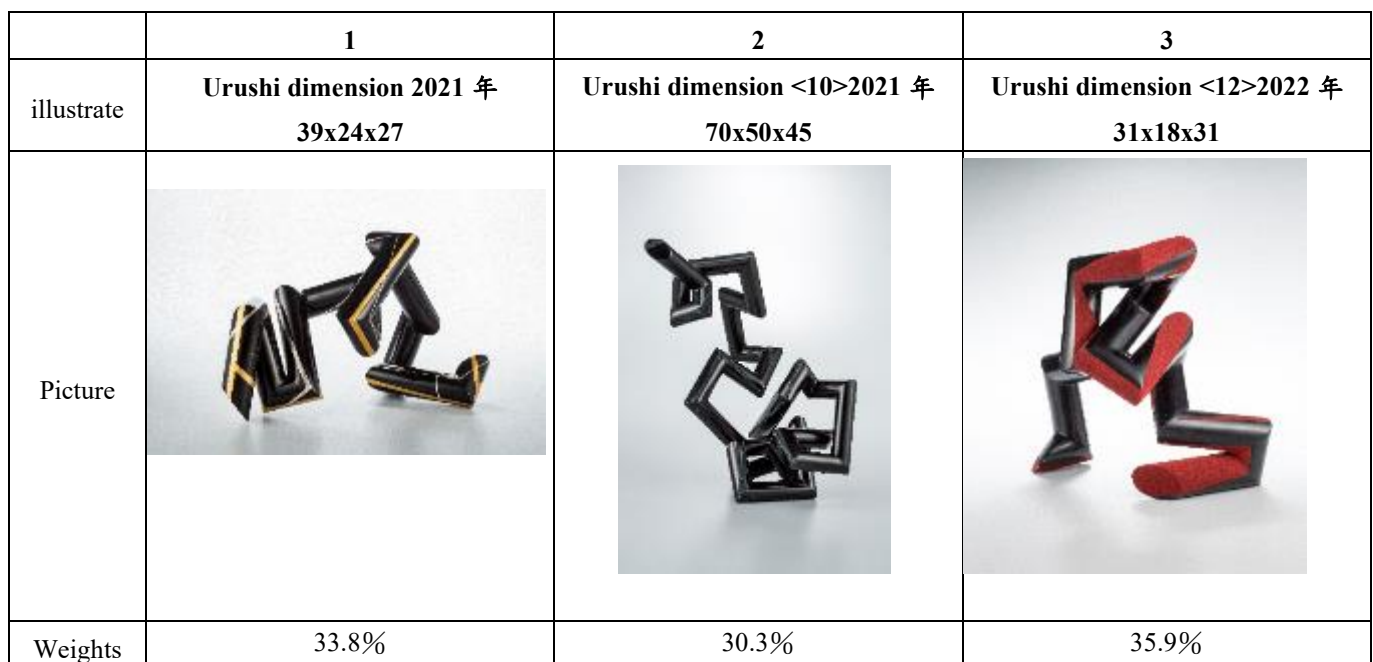
Table 4. Weight of Urushi art works.