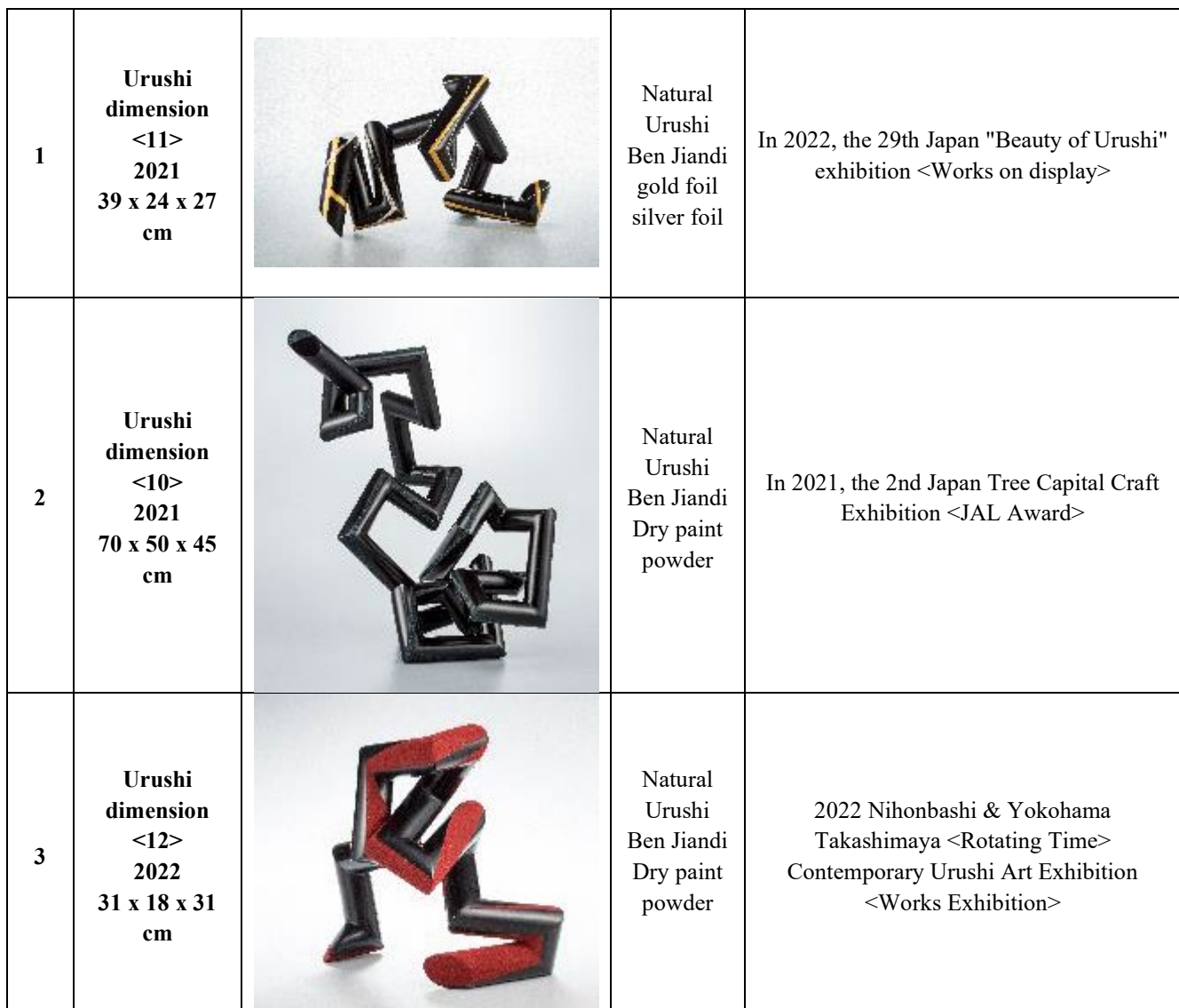
Table 1. Urushi dimension works.